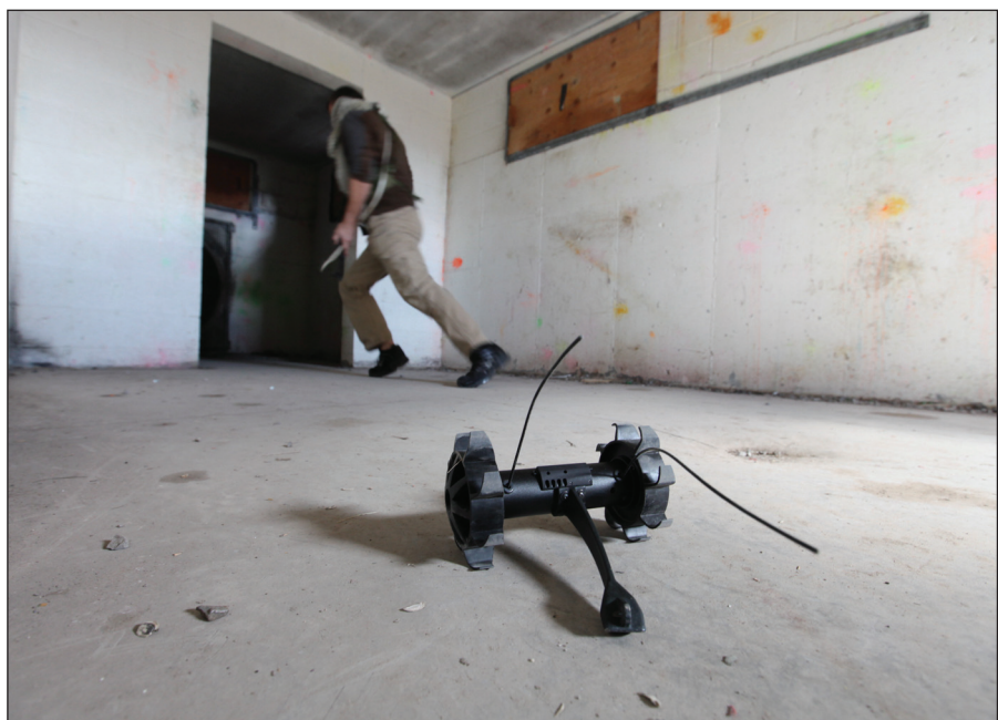
Robot can reveal enemy combatants and IEDs