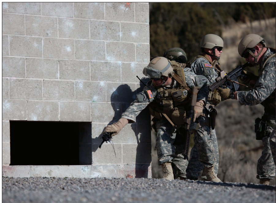
Deploying robot to search lower level

One of the most important performance characteristics of the Recon Scout XT is that it can be deployed in just five seconds, and using it requires no special training. Simply pull the activation pin and throw the robot through a window or doorway, over a wall, or into a bunker. Once the warfighter has deployed the device, he can direct it to move quietly